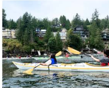
SPRING/ SUMMER ACTIVITY DAY