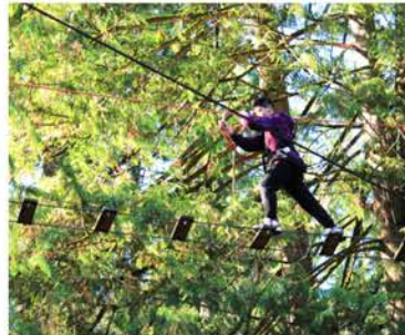
FALL ACTIVITY DAY