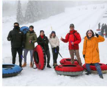
WINTER ACTIVITY DAY